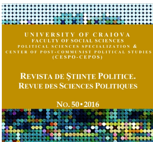
RSP issue no. 50/2016: "Timing the Past, Counting the Future: Human Security, Education and Cultural Identity in Eastern Europe"