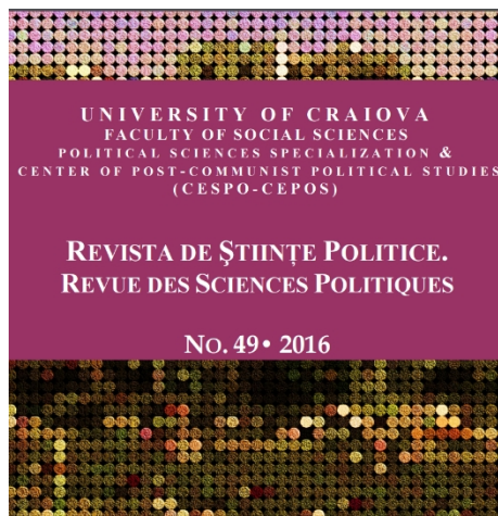
RSP issue no. 49/2016: "From Citizen to State: In Depth Post-Communist Analysis of Governance and Administration"

We started the thirteenth year of the RSP publishing with a full online issue in April 2016 ( RSP issue no. 49/2016) announcing an ambitious content challenging the citizen-state relation. The first issue of 2016 was entitled "From Citizen to State: In Depth Post-Communist Analysis of Governance and Administration" and it inaugurated an innovative focus on the governance-administration links in the Eastern landscape (as inputs of the political system) and the public participation, diaspora feedback, law applying and democratization practices within the Eastern-Western space (as outputs of the political system). RSP issue no. 49/2016 also explored the levels of the analysis of the relationship between Citizen and State and a comparative concept mapping of democratization and political legitimation.