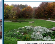
University of Craiova, The Botanical Garden