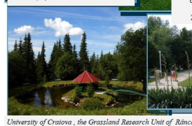
University of Craiova, the Grassland Research Unit of Rânca